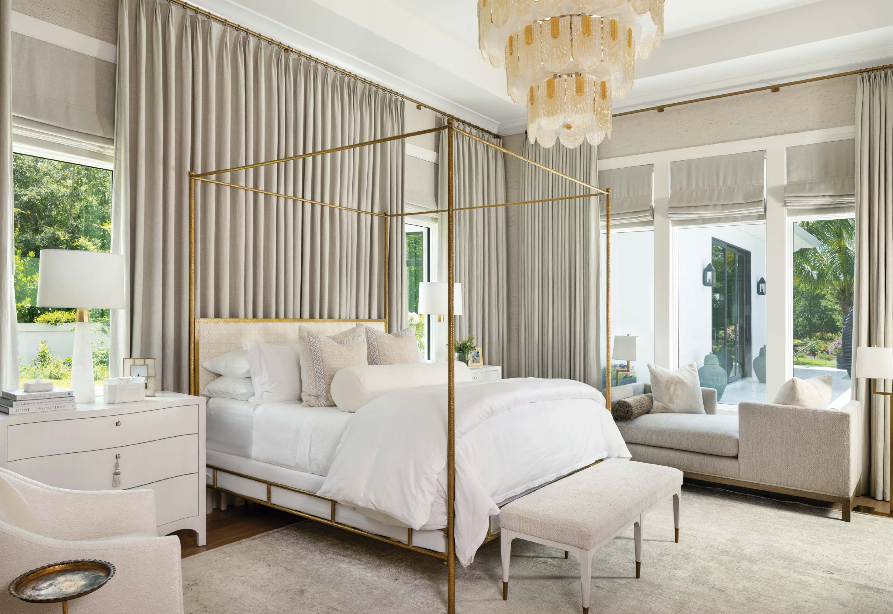
ABOVE: The design team accomplished the homeowners' request for a serene primary bedroom with a hand-hammered, gold-covered iron poster bed from the homeowners' collection, night chests by Highland House, and a window-side lounger by Jerry Pair. The lamps are by Visual Comfort and the chandelier is from Wilson Lighting.

layout and lighting composition with two multi-tiered glass chandeliers centered with the room's large window.