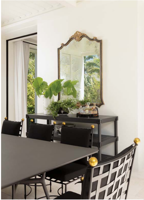
ABOVE: Amalfi armchairs from Janus et Cie and a buffet and mirror from Jerry Pair bring Mediterranean flair to the exterior dining area.