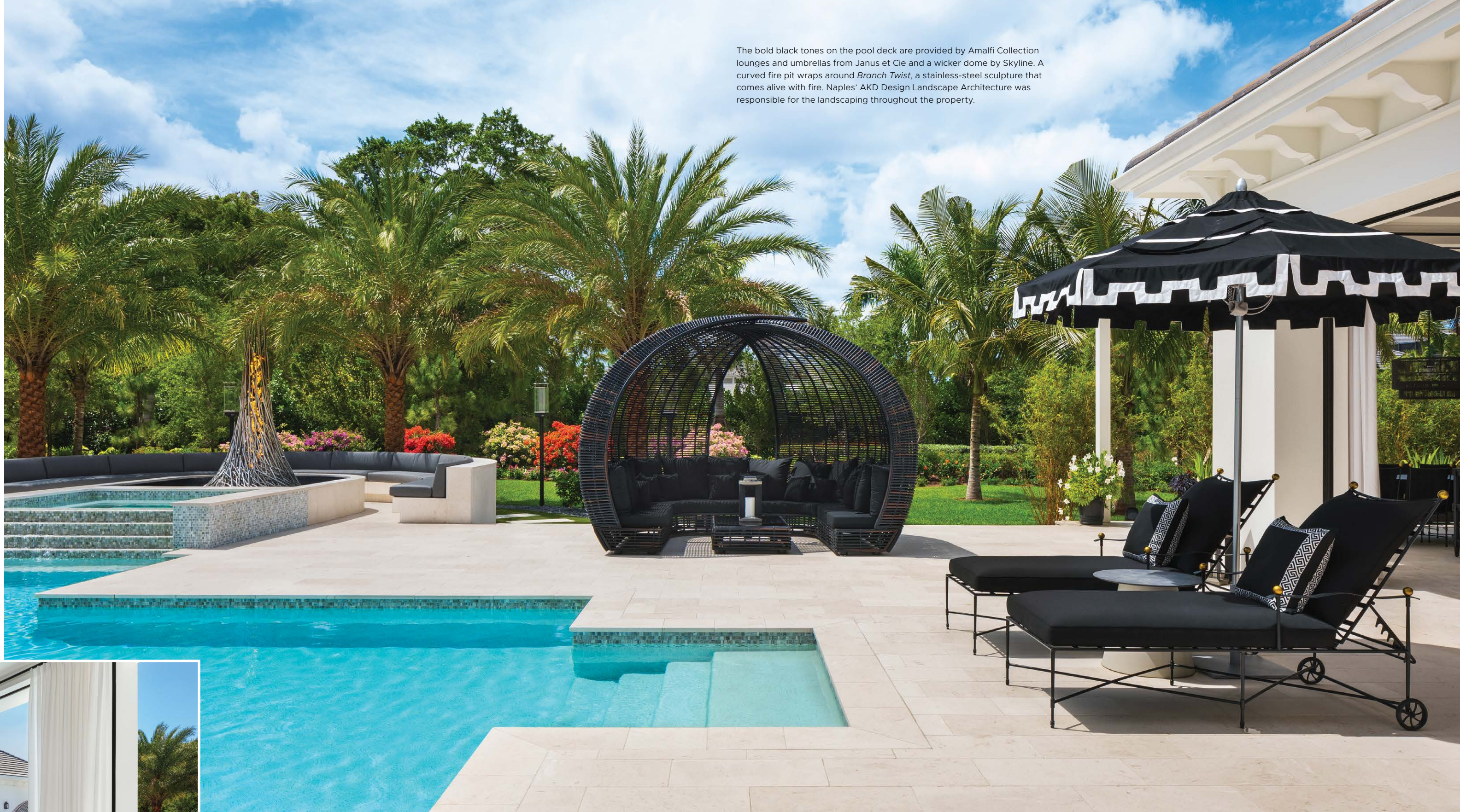
The bold black tones on the pool deck are provided by Amalfi Collection lounges and umbrellas from Janus et Cie and a wicker dome by Skyline. A curved fire pit wraps around Branch Twist , a stainless-steel sculpture that comes alive with fire. Naples' AKD Design Landscape Architecture was responsible for the landscaping throughout the property.